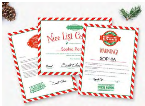
Letters From Santa