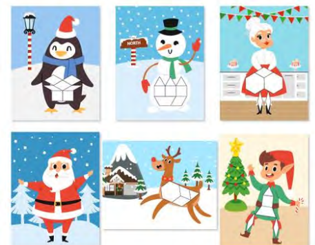
Christmas Pattern Block Mats