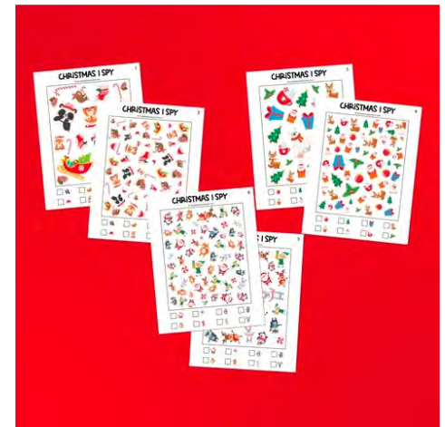
Christmas I Spy Printables