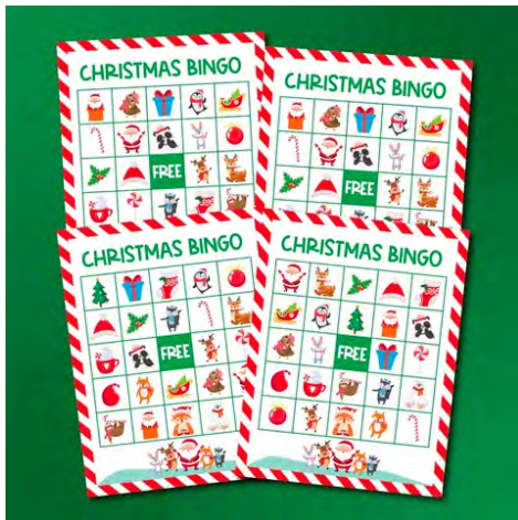
Christmas Bingo Cards

Thank you so much for downloading this free resource! Here are some other popular printables you may be interested in. Click on any of the pictures to learn more.