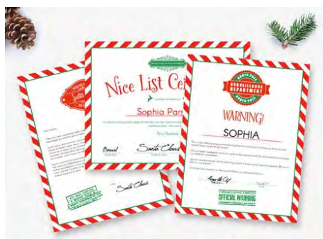
Letters From Santa