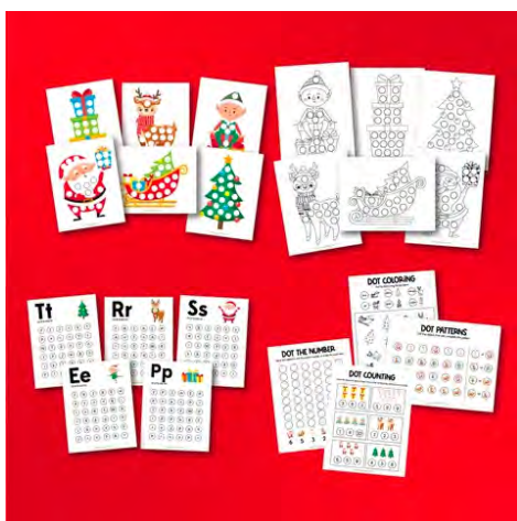
Christmas Do A Dot Printables