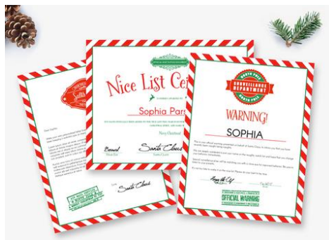
Letters From Santa