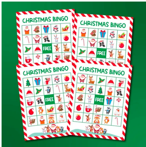
Christmas Bingo Cards

Thank you so much for downloading this free resource! Here are some other popular printables you may be interested in. Click on any of the pictures to learn more.