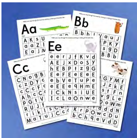
Alphabet Maze Worksheets