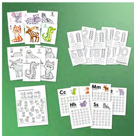
Animal Do A Dot Printables