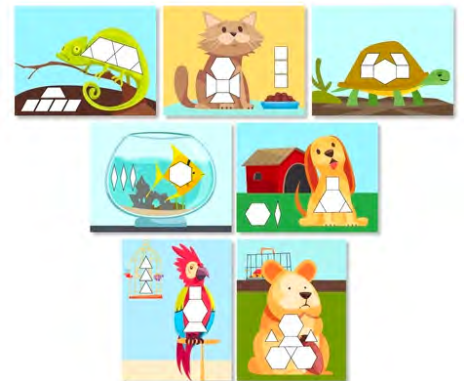
Pet Pattern Block Mats