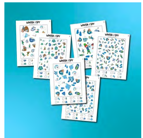
Winter I Spy Printables