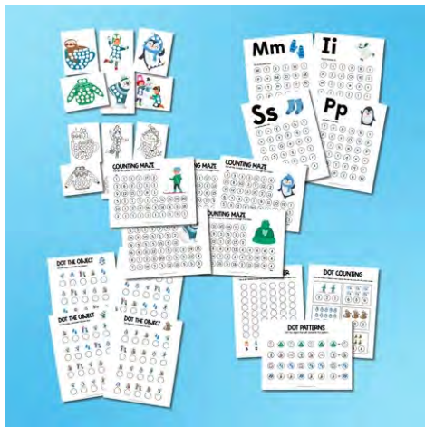
Winter Do A Dot Printables

Thank you so much for downloading this free resource! Here are some other popular printables you may be interested in. Click on any of the pictures to learn more.