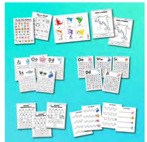
Ocean Animal Worksheets