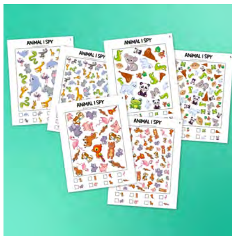
Animal I Spy