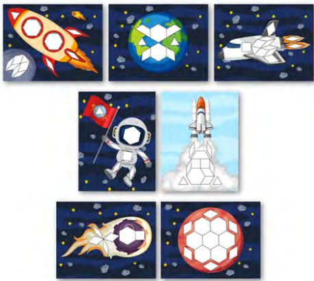
Space Pattern Block Mats

Thank you so much for downloading this free resource! Here are some other popular printables you may be interested in. Click on any of the pictures to learn more.