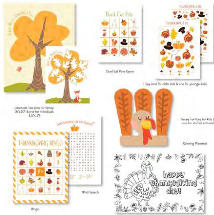
Thanksgiving Activity Pack

Thank you so much for downloading this free resource! Here are some other popular printables you may be interested in. Click on any of the pictures to learn more.