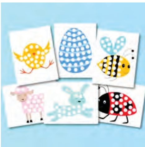
Easter Do A Dot Printables