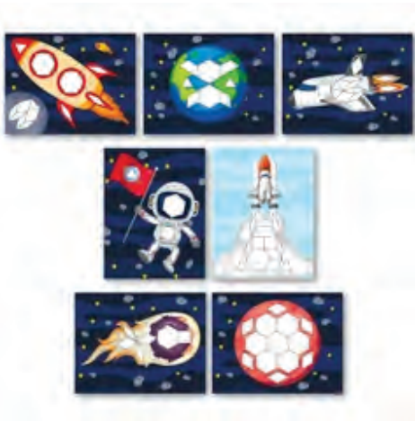
Space Pattern Block Mats

Thank you so much for downloading this free resource! Here are some other popular printables you may be interested in. Click on any of the pictures to learn more.