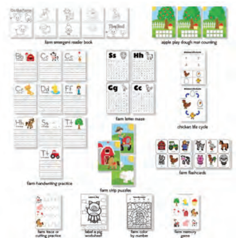
Farm Animal Printables