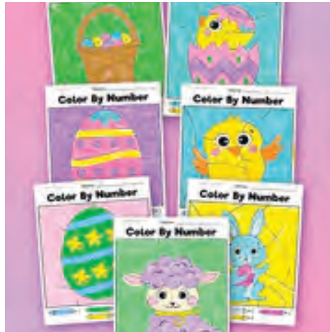
Easter Color By Numbers