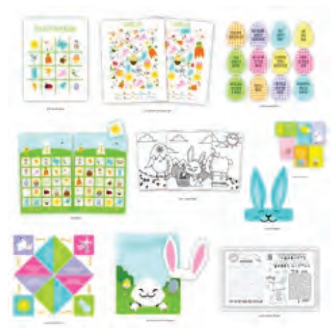
Easter Activities For Kids