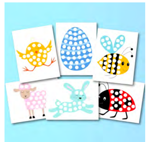
Easter Do A Dot Printables