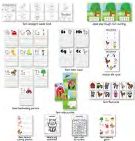
Farm Animal Printables

Thank you so much for downloading this free resource! Here are some other popular printables you may be interested in. Click on any of the pictures to learn more.