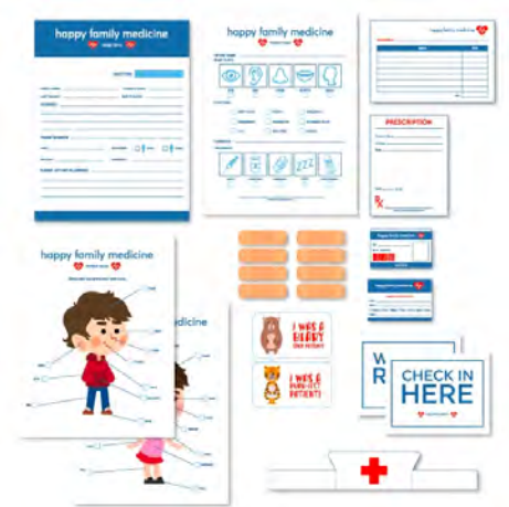
Dramatic Play Doctors Office