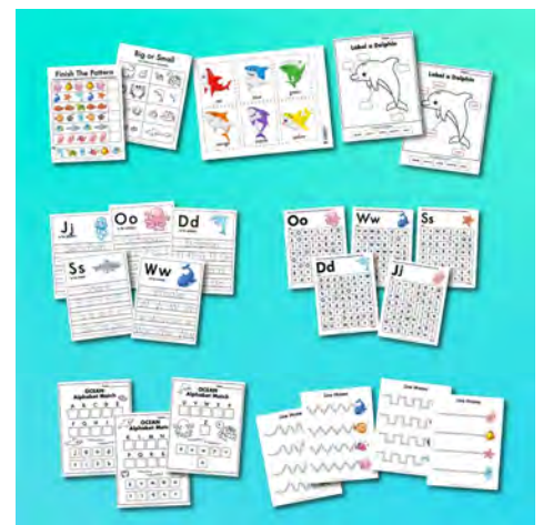
Ocean Animal Worksheets