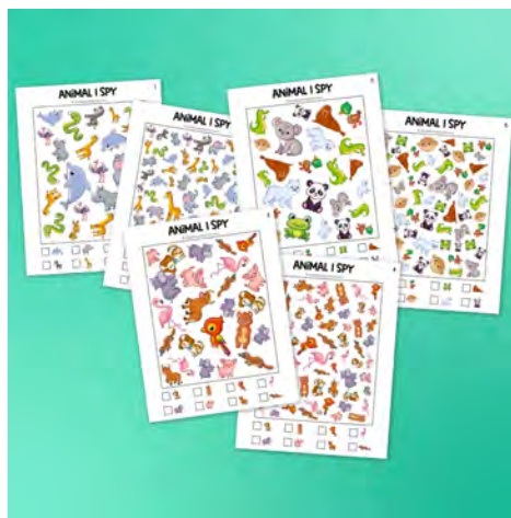
Animal I Spy