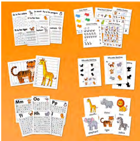
Zoo Animal Printables

Thank you so much for downloading this free resource! Here are some other popular printables you may be interested in. Click on any of the pictures to learn more.