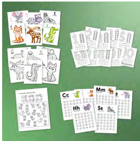
Animal Do A Dot Printables