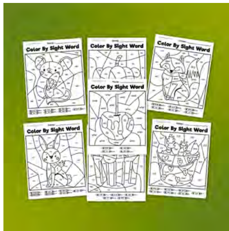
Fall Color By Sight Words