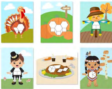
Thanksgiving Pattern Block Mats