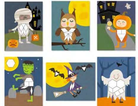
Halloween Pattern Block Mats