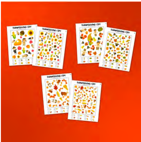
Thanksgiving I Spy

Thank you so much for downloading this free resource! Here are some other popular printables you may be interested in. Click on any of the pictures to learn more.