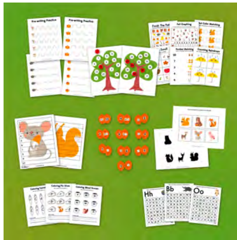
Fall Printables For Preschool