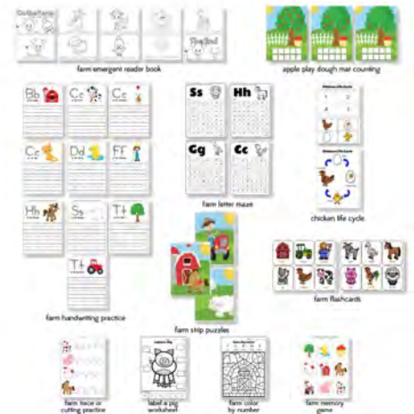
Farm Animal Printables