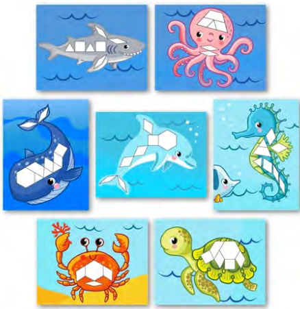
Ocean Pattern Block Mats

Thank you so much for downloading this free resource! Here are some other popular printables you may be interested in. Click on any of the pictures to learn more.