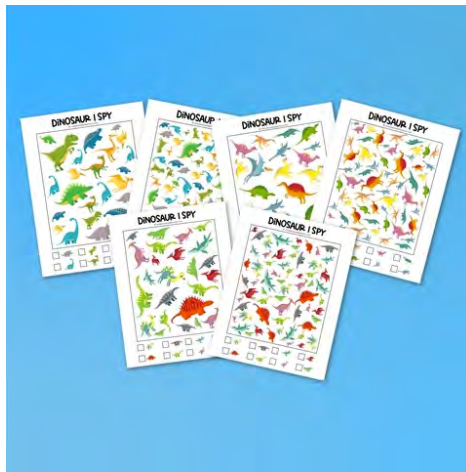
Dinosaur I Spy