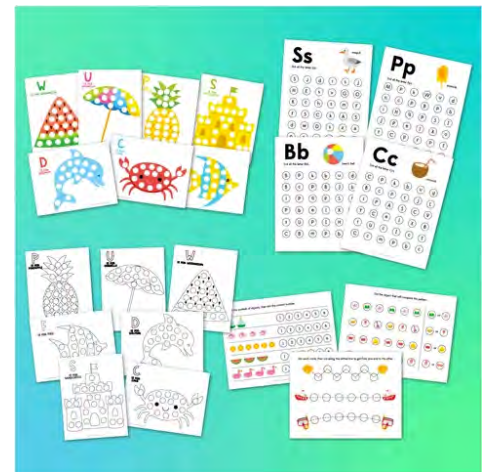
Summer Do A Dot Printables